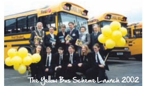
The Yellow Bus Scheme Launch 2002

On 25 February 2002 , Theresa May MP, then Shadow Secretary of State for Transport, Local Government and the Regions, officially launched the groundbreaking scheme at Magna Carta School, Egham. It was the first one in the South of England. All four 60 seater buses, in service at that time, were there and 1000 yellow balloons were released as part of the celebrations.