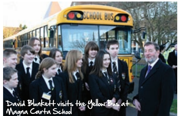
David Blunkett visits the Yellow Bus at Magna Carta School

The Business Partnership has secured sponsorship to contribute to the running costs, the remainder is made up of development funding and fares. Several unsuccessful bids have been made to get funding to expand the service to more schools and students.